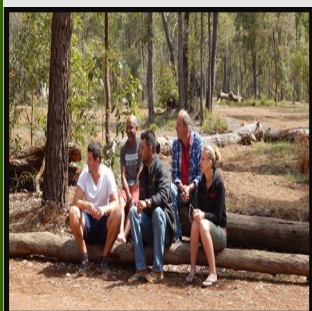
Lake Navarino 2013